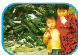
Cartridges illegally dumped in China

It is a fact that many recycling schemes try to avoid paying these landfill taxes by sending the waste abroad (cheaper landfill sites) - this photo shows empty printer cartridge