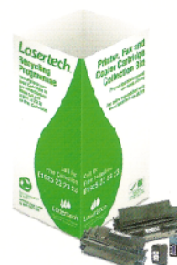
LRP Recycling Bin

If you know of a business, school, charity or organisation that would benefit from the Lasertech Recycling Programme tell them about it!