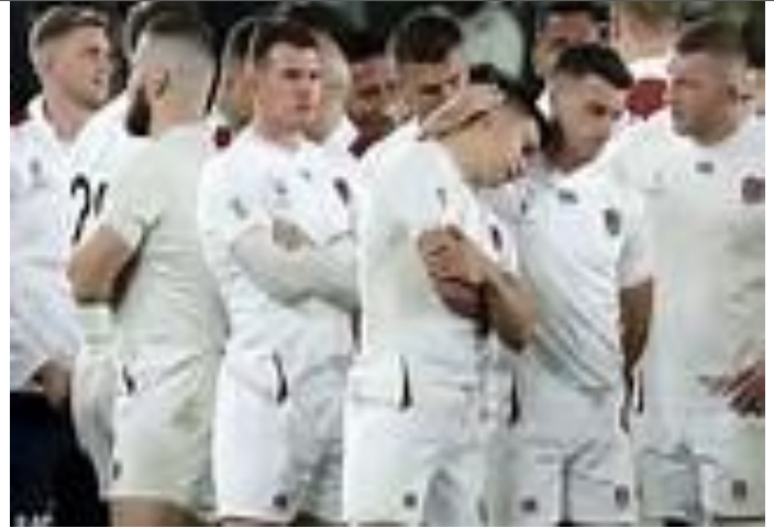
The disappointed England rugby team.

Around the world lots of things have happened in the last few months. England lost in final of the Rugby world cup, but securing second place. Brexit has been delayed until 2020 and an election recently took place across the UK. A typhoon struck Japan in which 2 games had to be cancelled of the Rugby World Cup. Thousands of fires are burning in Brazil, many of them in the world's biggest rainforest, which is sending clouds of smoke across the region and pumping alarming quantities of carbon into the world's atmosphere. Finally just in time for Christmas Frozen 2 has been released - we look forward to some renditions of the new songs in our talent show next year.