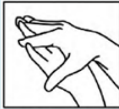
The back of the hands