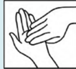
The tips of the fingers